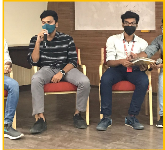
Students Actively Participating in Group Discussion